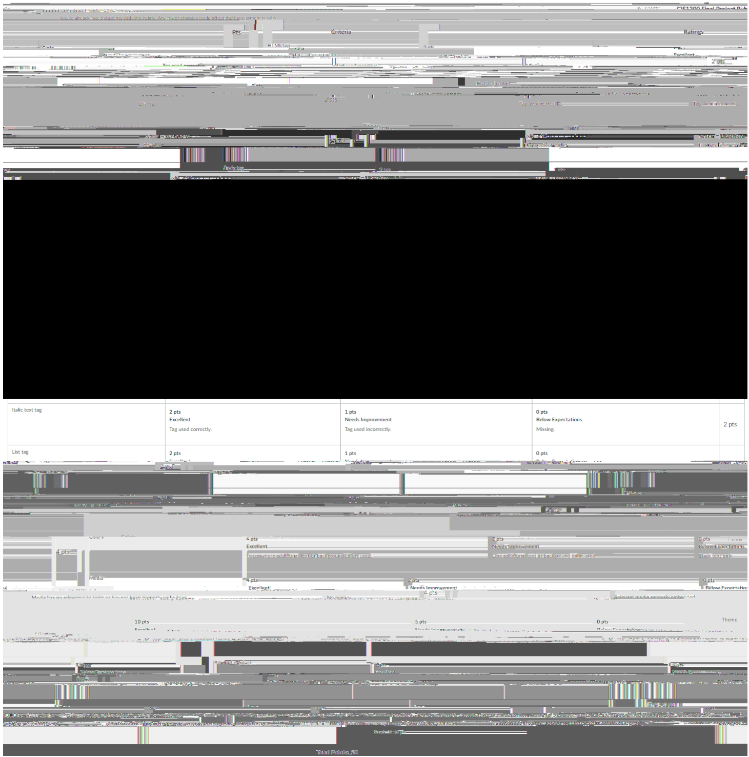
CIS2300 Final Project Rubric